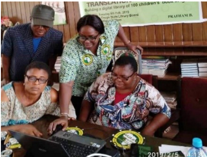
StoryWeaver physical training in Enugu, Nigeria

The trainings and work on the open source platform also afforded the librarians that participated a great opportunity to sharpen their digital editing and creative skills.