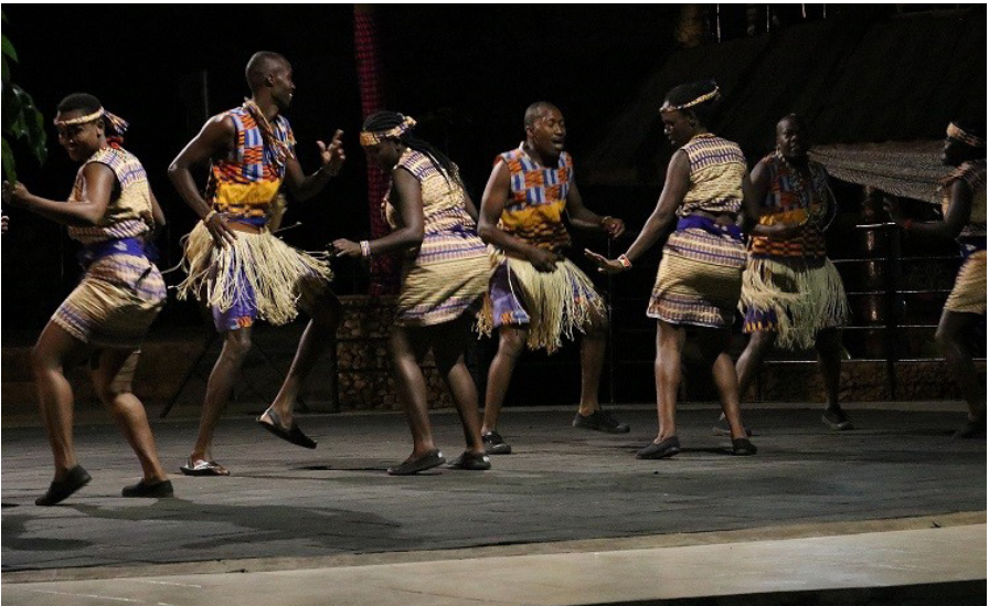
Cultural Dancers entertaining the Conference Delegates at the Bomas of Kenya