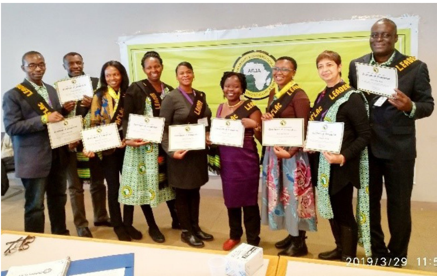
AfLIA Leadership Academy Cohort 1 study tour to USA

engagement, innovative services and possibilities of new pathways in raising funds for their libraries. A graduation ceremony was held for the participants at the American Library Association Meeting Room, Chicago. The report on the visit can be accessed at https://web.aflia.net/aflac-exchange-visit-to-chicago/