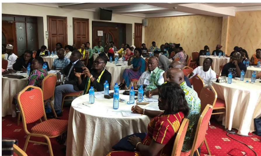
AfLAc Cohort 2 workshop in session in Nairobi, Kenya