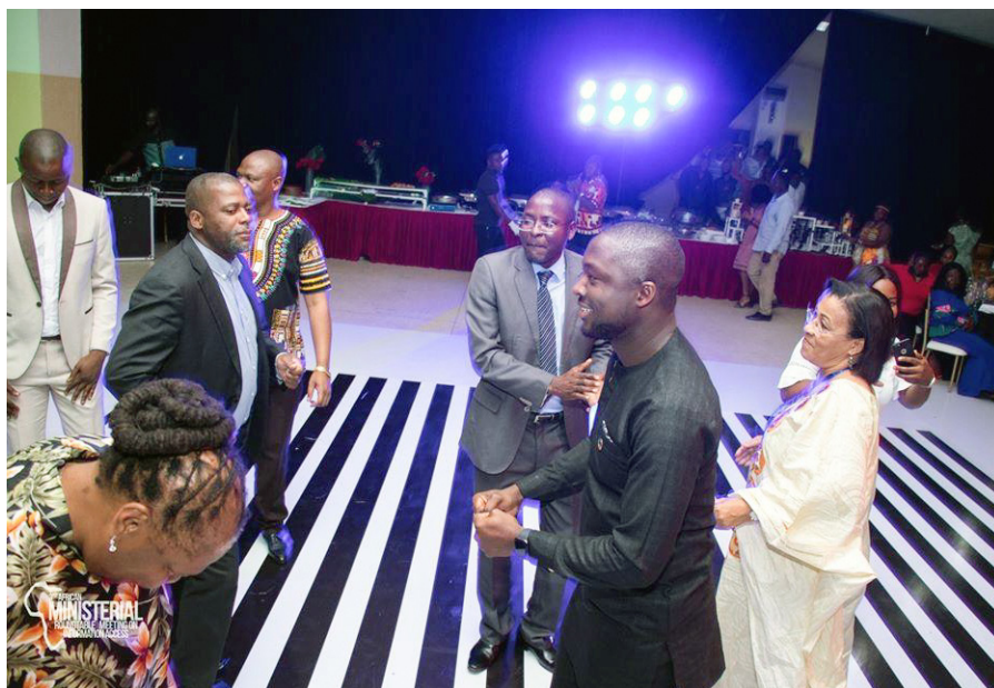
Delegates showing their dancing skills