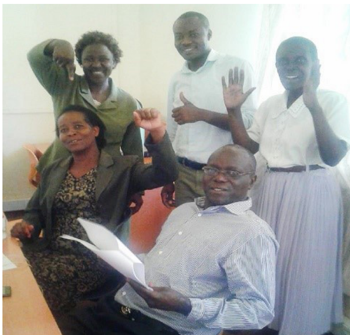
StoryWeaver virtual training in Kenya