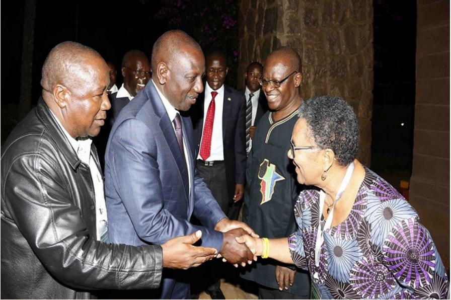
Executive Director of AFLIA welcoming the Deputy President of Kenya, Hon. Dr. William S. Ruto to the Cultural Night at Bomas of Kenya