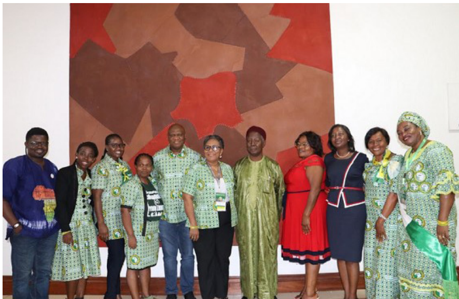
Inaugurated 2019-2021 AFLIA Governing Council Members who were in Nairobi, Kenya