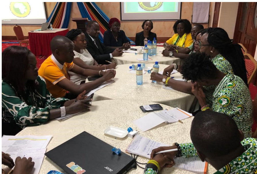
INELI-SSAf Cohort 2 training in session in Nairobi, Kenya