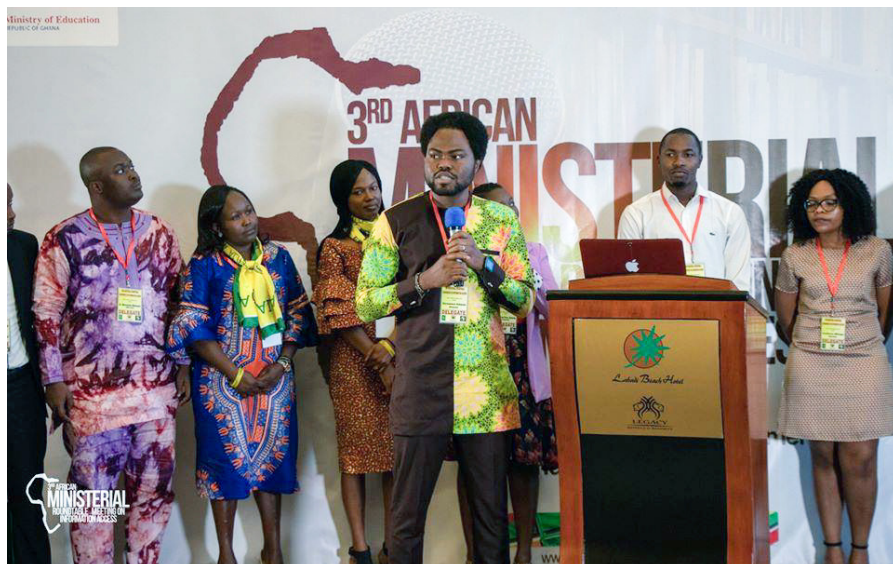
Young African Library professionals making their presentation

Opportunity was also given to the Young African Library Professionals to share knowledge on AU 2063 Agenda, Libraries and Pathways for creating the Africa We Want.