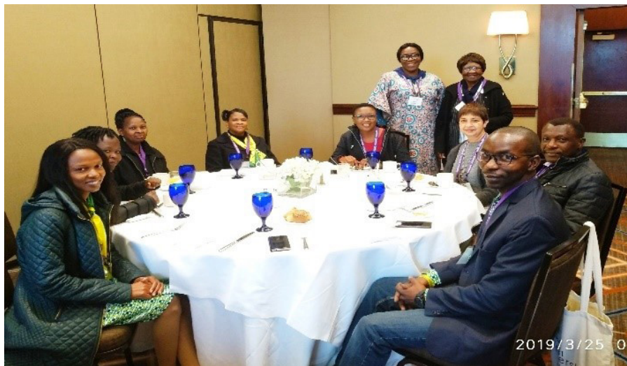
AfLIA Leadership Academy Cohort 1 study tour to USA