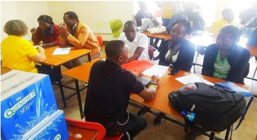
INELI-SSAf Cohort 2 training Library workers from Kibera Schools