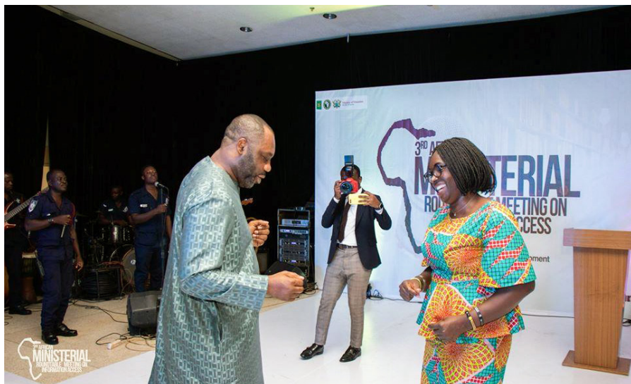
The Minister, Dr. Matthew Opoku Prempeh dancing with his Deputy Minister of Education