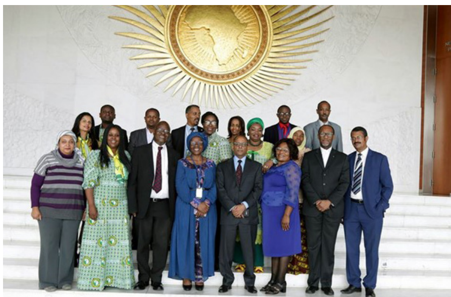
Participants at the Africa Union workshop in Addis Ababa to draw a reading Policy for Africa