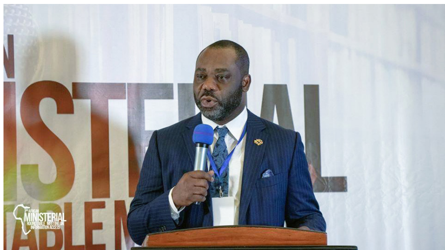
Ghana's Minister of Education- Hon. Dr. Matthew Opoku Prempeh delivering his Welcome Address