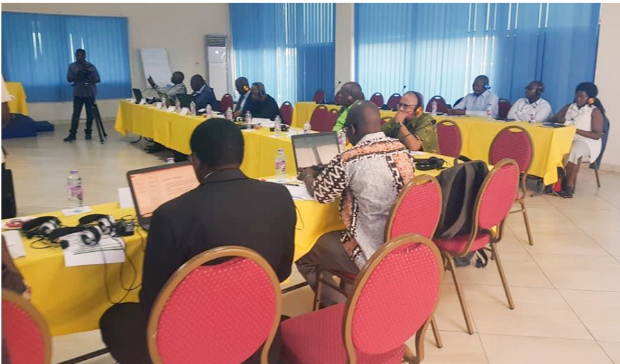
Some of the Directors of National Libraries in Africa at the one -day meeting

the AU 2063. Thirty- two (32) National Librarians attended the meeting. They had the opportunity to interact among themselves at the meeting, and then with their Ministers as well as Emerging African Library Leaders who attended the Ministers roundtable from 29th -30th.