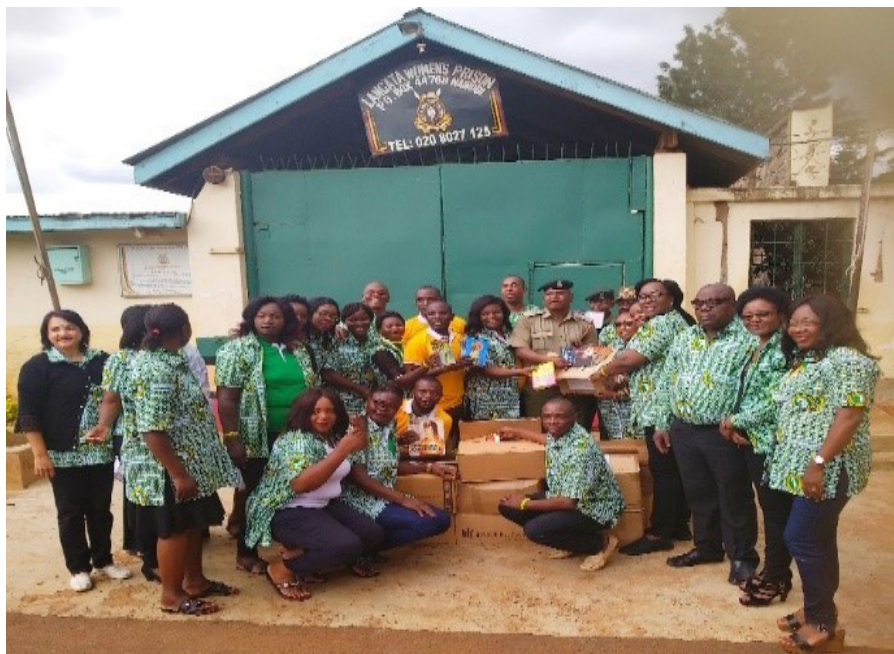
Presentation of books to Langata Women Prison, Nairobi