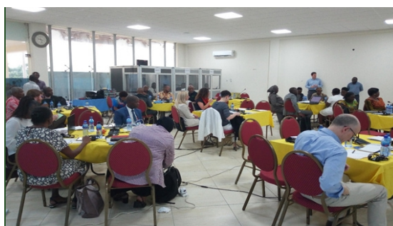
AfLIA-TASCHA Advancing Library Visibility in Africa Project Stakeholders Meeting in Accra, Ghana, February 2018

In the 3rd quarter, the project team launched a geo-spatial data platform to begin collection of individual library location and service data. After a period of beta testing, the platform will be opened to national libraries, public library services, and related partners. The initial tests for data collection was focused on public and community libraries, but the platform will be configured so that any type of library can submit location and service information. Once location and service data are collected it will be combined with geo-spatial and other types of datasets to help connect public and community libraries to larger development agendas, including the Sustainable Development Goals (SDGs) and Agenda 2063.