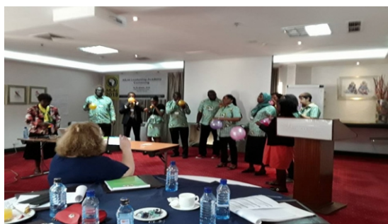
AfLAc Cohort 1 convening in Nairobi, Kenya, January 2018

"AfLIA has developed and capacitated me in such a way that I am now capable of introducing library services and programs in my library that are meeting international standards"