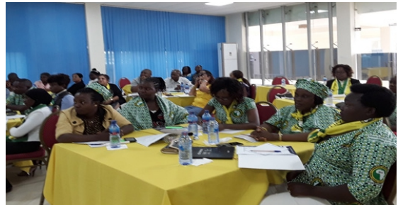
INELI-SSAf Cohort 1 -last Convening in Accra, Ghana in May 2018 in session

INELI-SSAf Cohort 2 with 32 participants from 11 African countries took off in May 2018 and will end in May 2020. Participants are also being mentored by 8 experienced public librarians, some of whom are graduates of the INELI-SSAf Cohort 1. The mentors assist in building the capacity of these participants to provide relevant and timely information to their communities to meet their needs and improve their livelihoods.