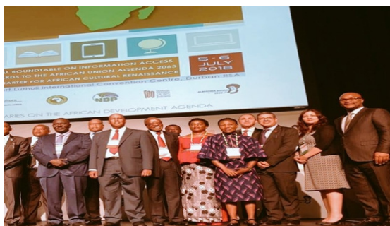
Some Ministers and Country representatives who attended the 2-day roundtable meeting for African Ministers responsible for Libraries, in Durban South Africa.