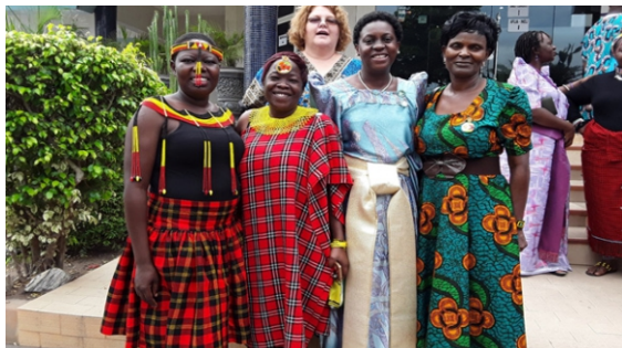
A mentor and her mentees in Accra, Ghana at the graduation of INELI-SSAf Cohort 1 in May 2018