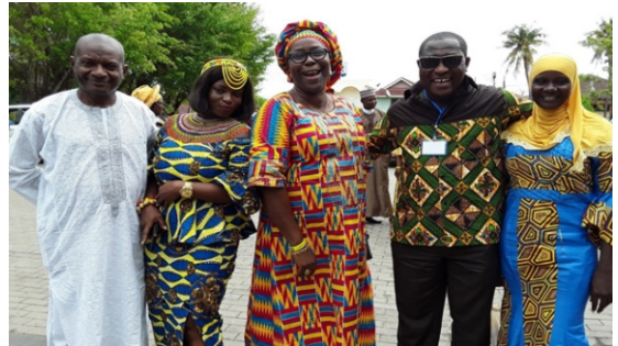
A mentor and her mentees in Accra at the graduation of INELI-SSAf Cohort 1 in May 2018