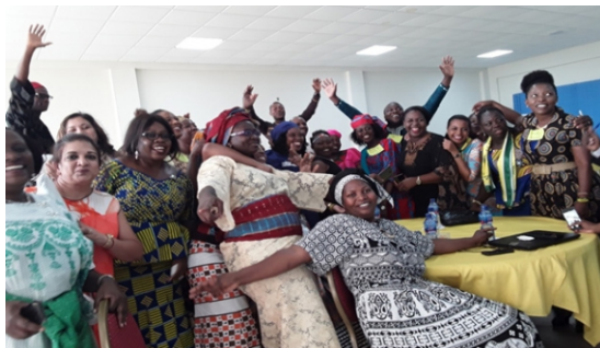
INELI-SSAf Cohort 2 Mentors and mentees – All work no play.....