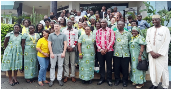
INELI-SSAf Cohort 1 in Accra, Ghana, May 2018 - unity of purpose to develop public libraries in Africa

The INELI-SSAf Cohort 1 with 32 participants from 14 African countries mentored by 8 experienced public librarians which took off in June 2016 graduated in Accra, Ghana in May 2018.