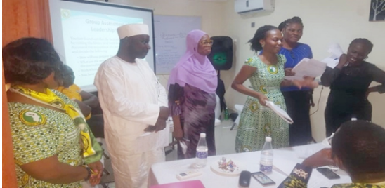
SILL Nigeria participants going through Group Assessment of Leadership activity