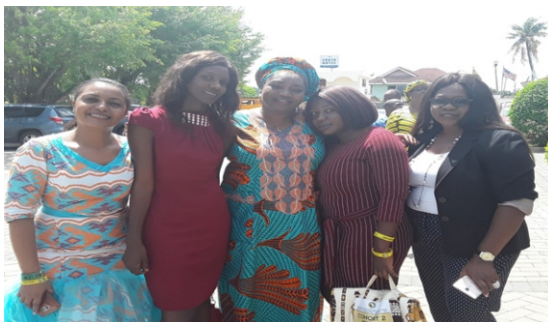
A mentor of INELI-SSAf Cohort 2 and her mentees at the 1st Convening, Accra, Ghana in May 2018