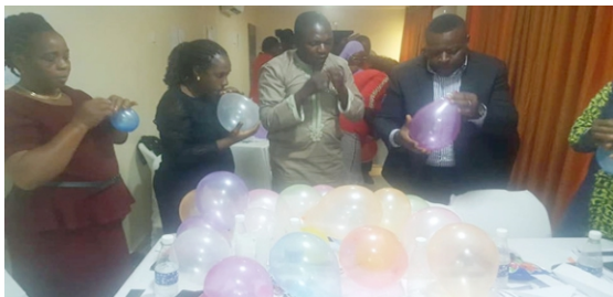
SILL Nigeria participants going through the balloon blowing activity