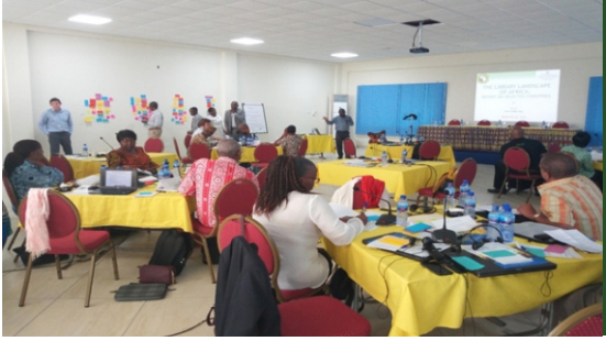
AfLIA-TASCHA Advancing Library Visibility in Africa Project Stakeholders in Meeting

Work started in the last quarter of the year on the perception problem of libraries being overlooked as development partners. The project asks questions about how public libraries can respond to the perception problem to demonstrate their value as development partners. This research work, which will be in three phases will be undertaken in four countries and is expected to end by 2020.