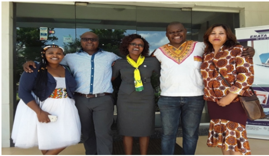
A mentor of INELI-SSAf Cohort 2 and her mentees at the 1st Convening, Accra, Ghana in May 2018