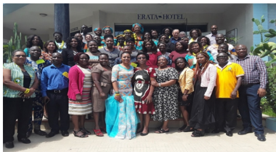
INELI-SSAf Cohort 2 in Accra Ghana, beginning their journey of two years