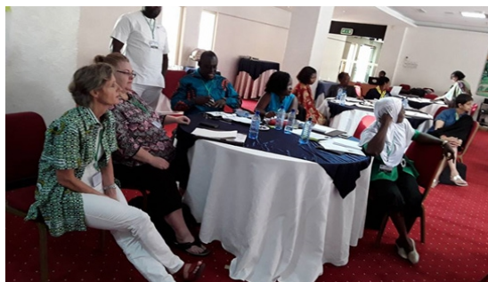
AfLAc Cohort 1 convening in Nairobi, Kenya, January 2018