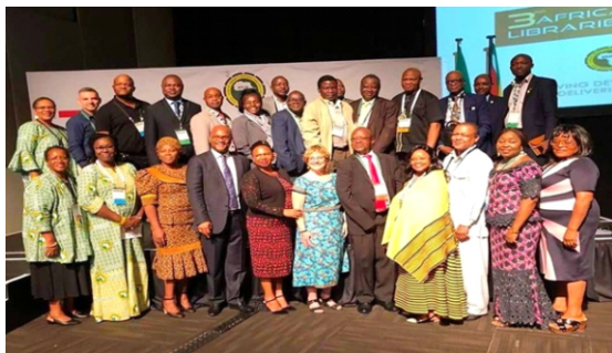
The Minister of Arts & Culture, South Africa, AfLIA Officials and representatives of African Library leadership at the opening ceremony of the 3rd Public Libraries Summit