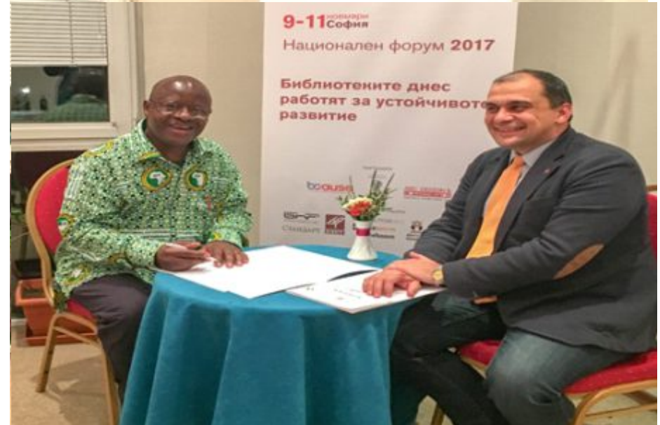
AflIA President signing the MoU with the Global Libraries- Bulgaria Foundation