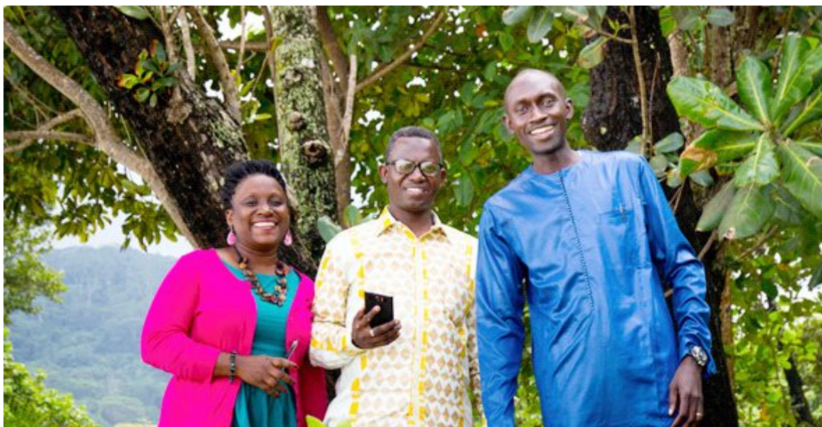
All work and no play... INELI-SSAf mentors hitchhiking after a hard day's work at the 2nd convening in Seychelles in February 2017