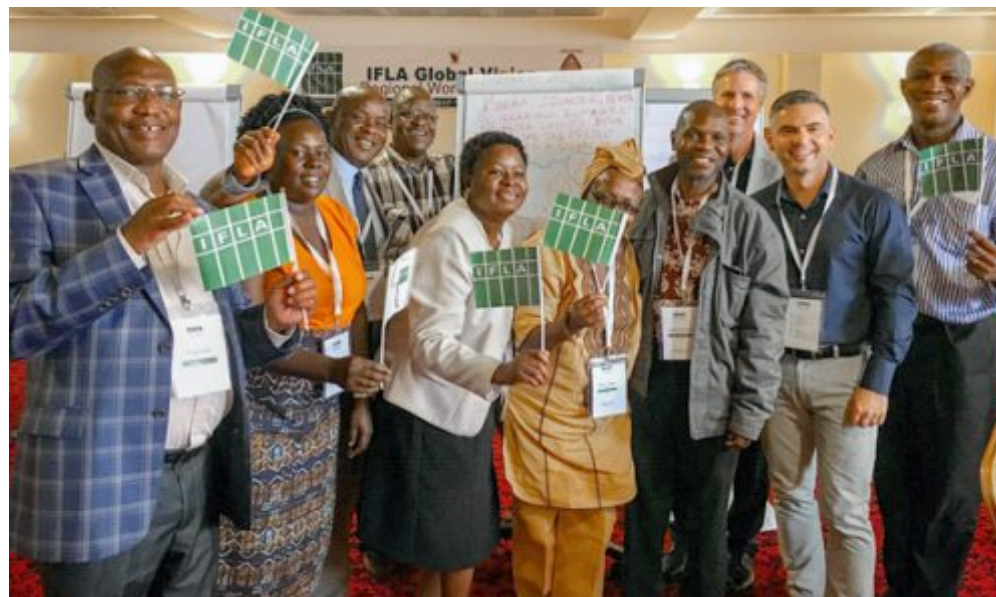
Broad smiles and happy faces after a successful presentation - Group 1 IFLA Global Vision Workshop held in Yaounde, May 2017