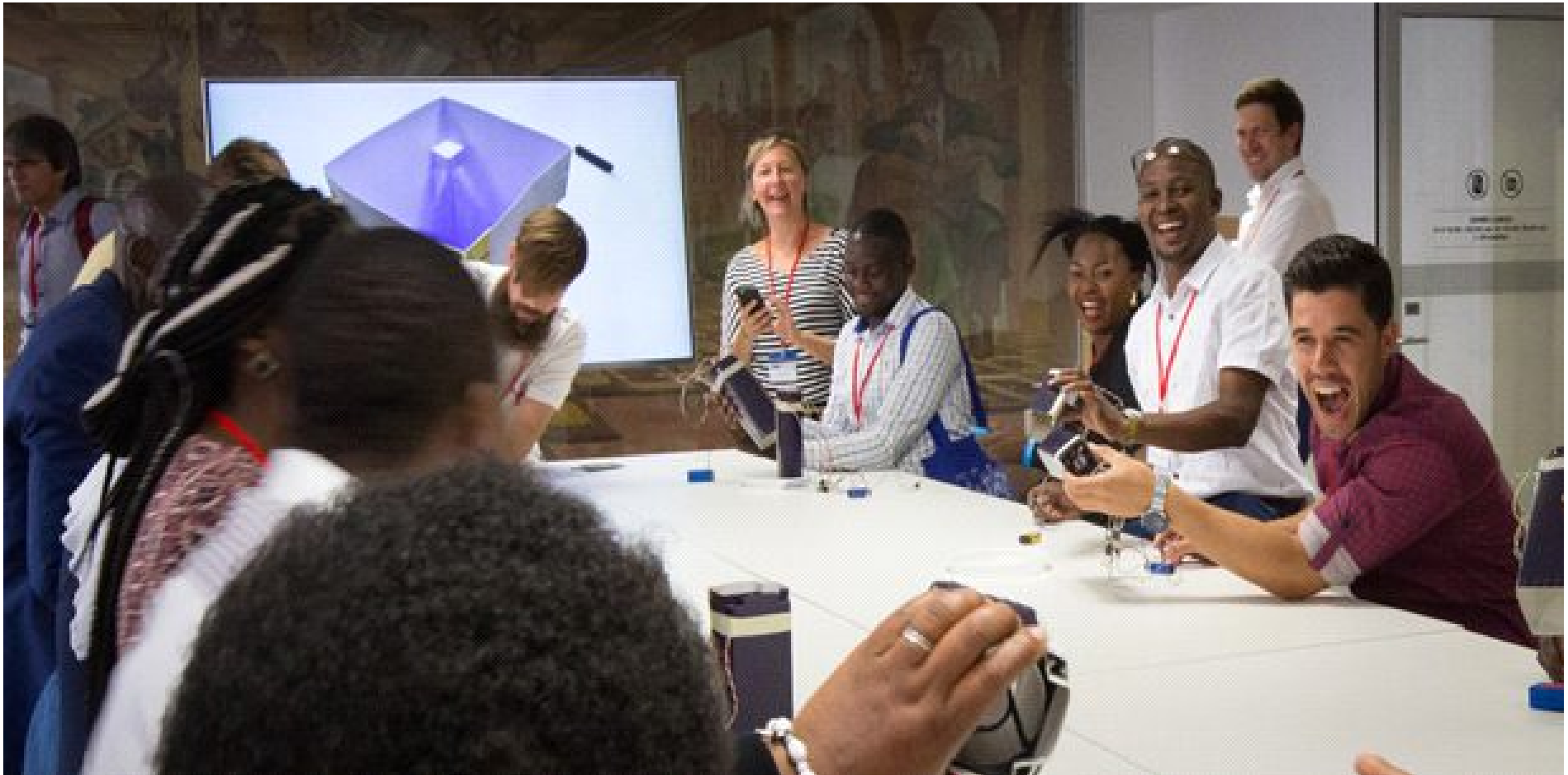
IYALI 2017 participants in Action in Lithuania learning how to use recycled, donated, repurposed “junk” in Lithuania to create a makerspace.