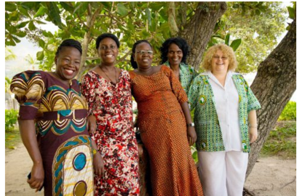
INELI -SSAf innovators from Uganda and Zimbabwe in Seychelles with their mentor from South Africa - unity of purpose to develop public libraries in Africa