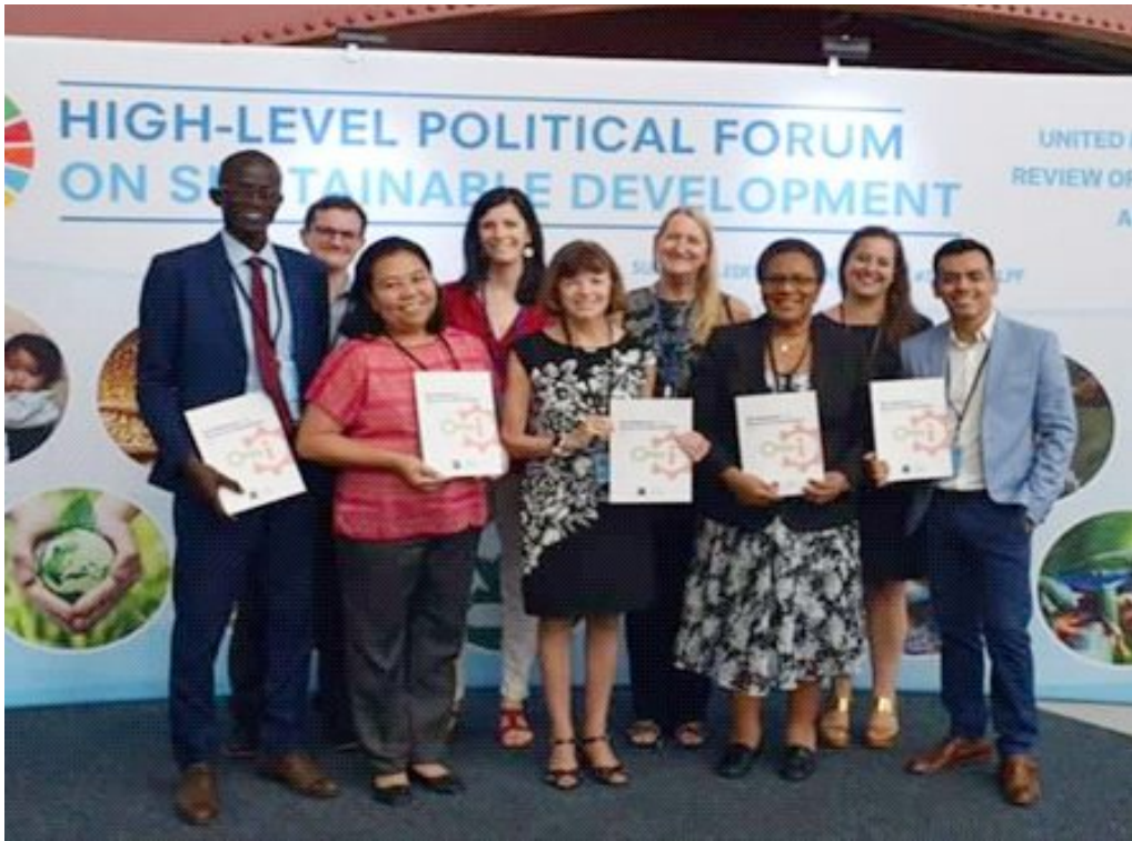
IFLA Team at the UN High Level Political Forum in New York, from 12-18 July