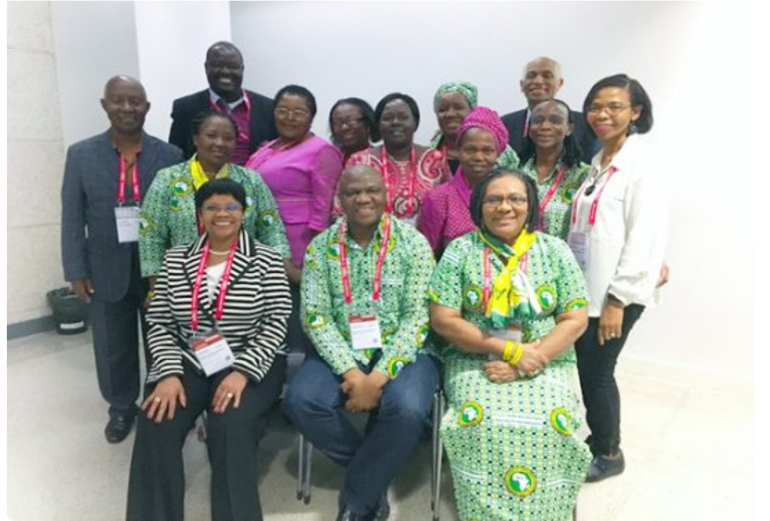
AflIA Council Members with Observers at the 5th AflIA Council Meeting held at Conference Room C, Centenary Center, Wroclaw, Poland