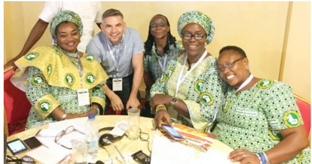
Excited participants at the beginning of the day's work at the 4th African Library Summit & 2nd AfLIA Conference, in Yaounde, Cameroon. May 2017

AfLIA organises a biennial Library Summit to enable knowledge sharing of innovations and also for networking. The 4th African Library Summit and 2nd AfLIA Conference, a 4-day event was held from 16 - 19 May 2017 in Yaounde, Cameroon.