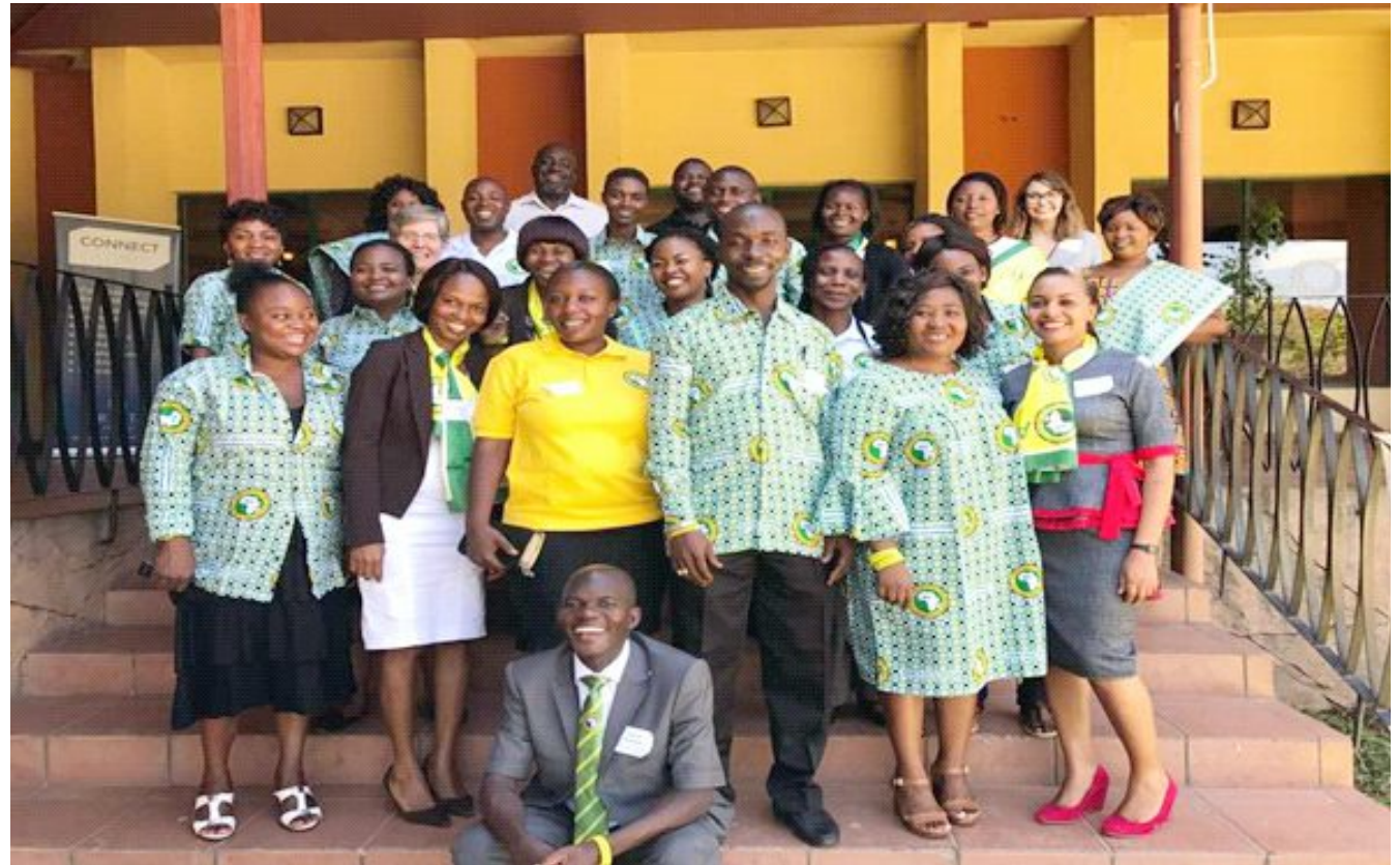
Happy participants and facilitators after Day One of the SILL workshop in Zambia