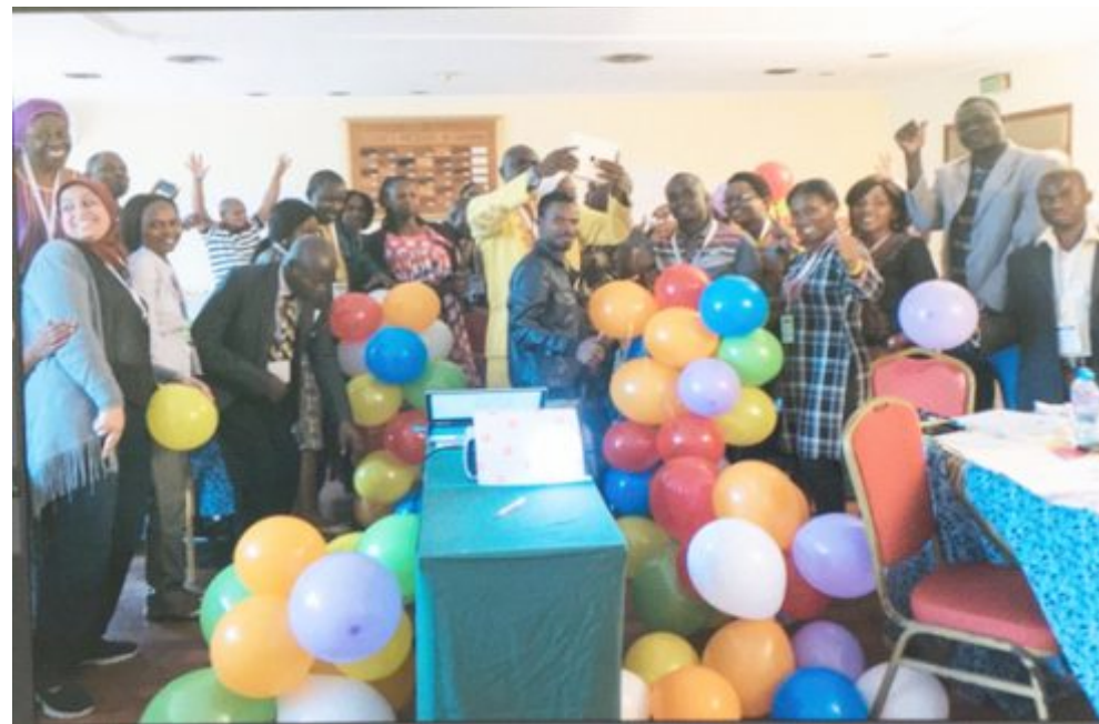
SILL Participants in Yaounde , Cameroon, engaging in an activity to build the tallest balloon tower