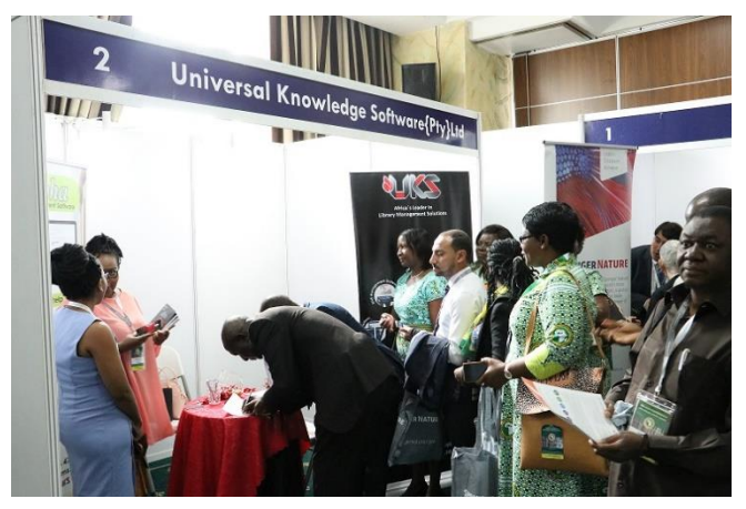
Delegates at the Conference exhibition Center

At the Exhibition Hall, exhibitors were fully represented and maximized their participation to showcase their products and services, make new contacts and strengthen existing networks. The exhibition hall was colourfully designed and filled