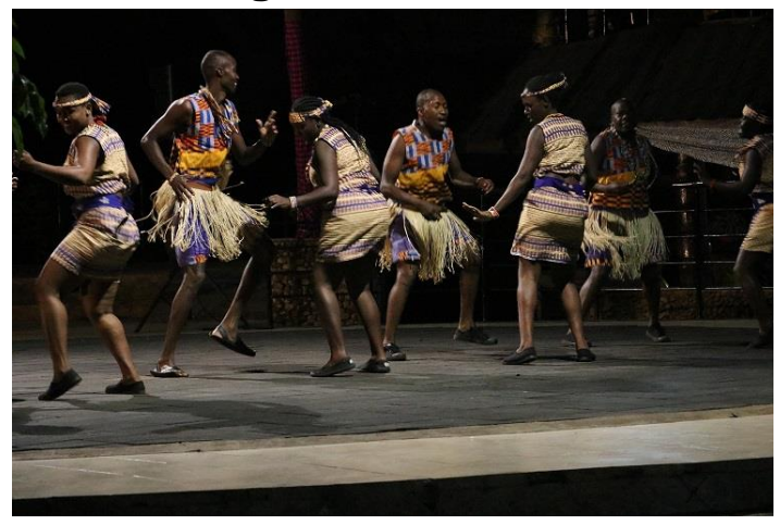
Cultural Dancers entertaining the Conference Delegates at the Bomas of Kenya

Aside the welcoming conference environment. delegates were treated to a memorable Cultural Night and Dinner at the Bomas of Kenya Restaurant (about 15minute drive from the conference venue) on 22<sup>nd</sup> May, 2019. At this event, delegates were treated to a series of beautiful theatrical dance performances and authentic performed by music people representing the rich and diverse cultures of Kenya. Having the